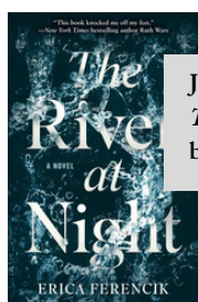
July 19 The River at Night by Erica Ferencik